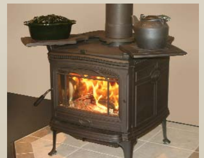
Concealed swing-out Cook Top means warm meals in wild winter weather.

The radiant heat of cast iron, the convective warmth of steel design is conveniently sized in the T4 for spaces up to 1500 sq. ft.