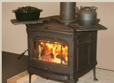
Concealed swing-out Cook Top means warm meals in wild winter weather.